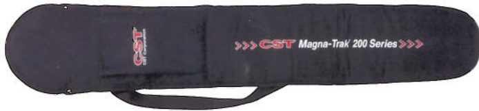
Soft Padded Cordura® Carrying Case