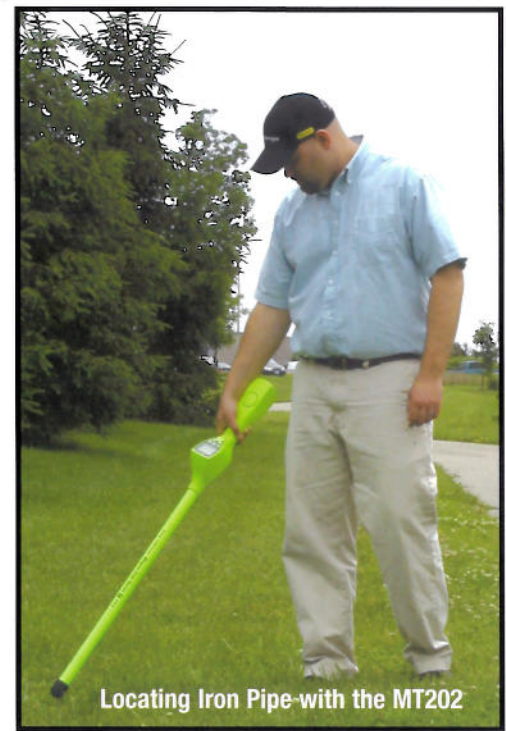
Locating Iron Pipe with the MT202

Chicago Steel Tape Berger Instruments Magna-Trak® LaserMark® Tru-Lock™