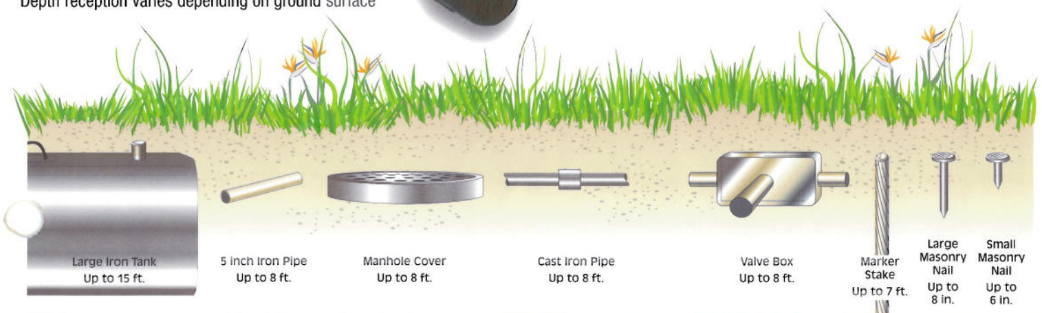
Typical Object Depth Diagram Depth reception varies depending on ground surface

Specifications subject to change without notice.