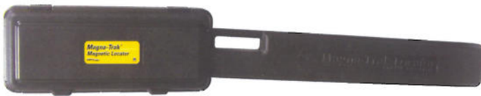
Hard Carrying Case